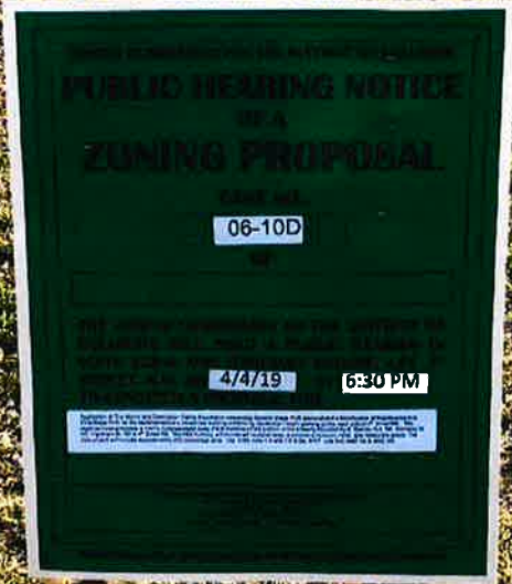
3/13/19 4 th Street NE #10