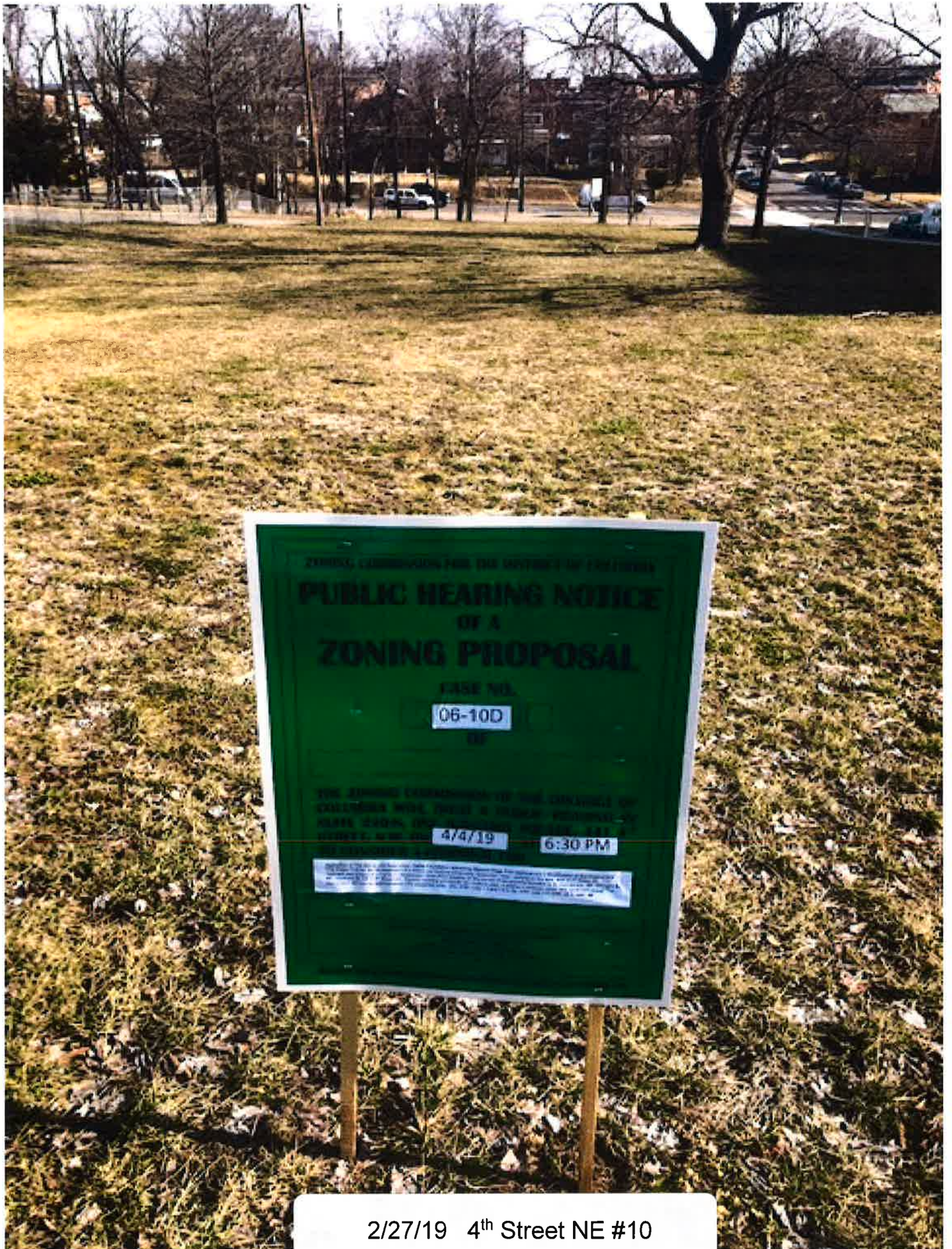
2/27/19 4 th Street NE #10