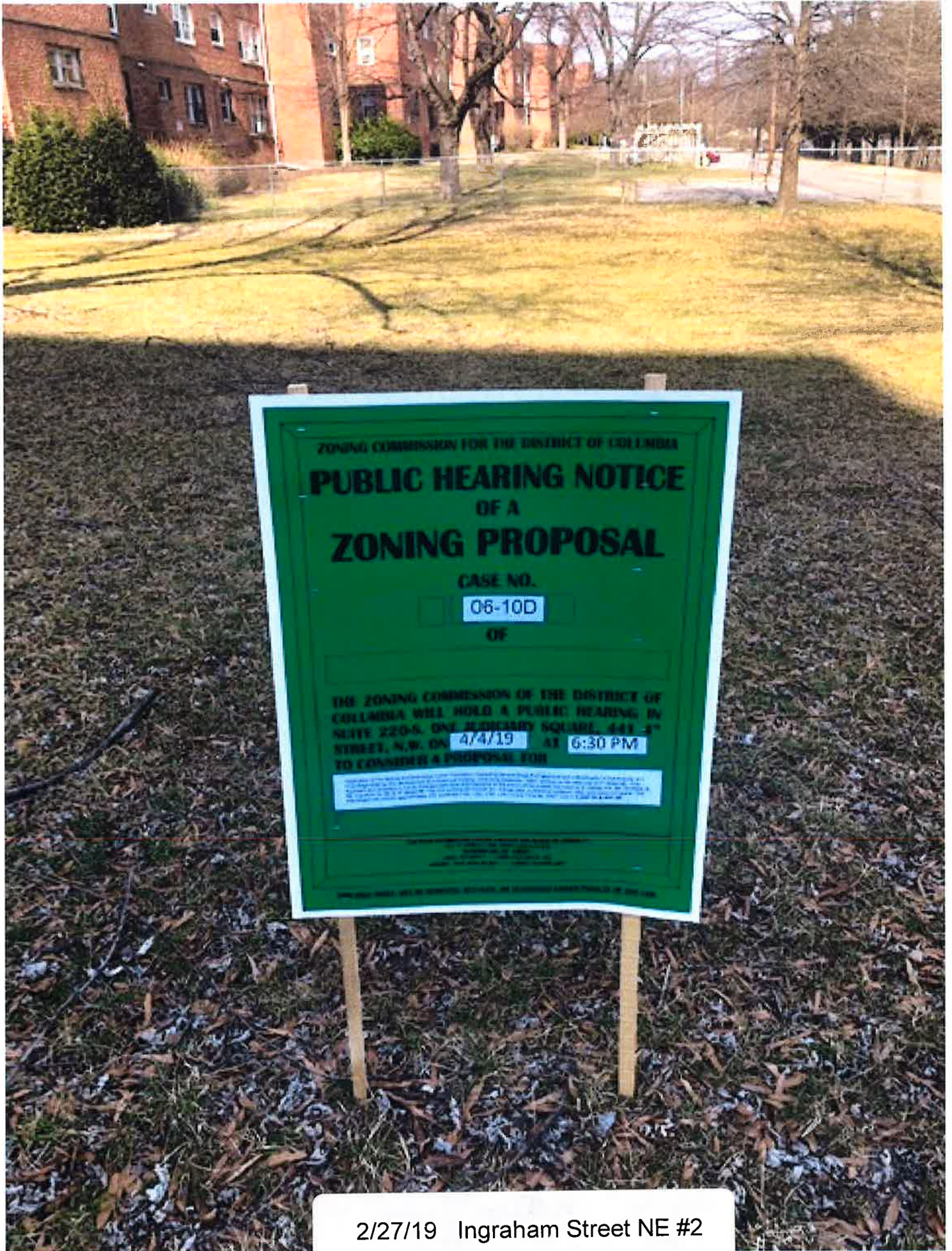
2/27/19 Ingham Street NE #2