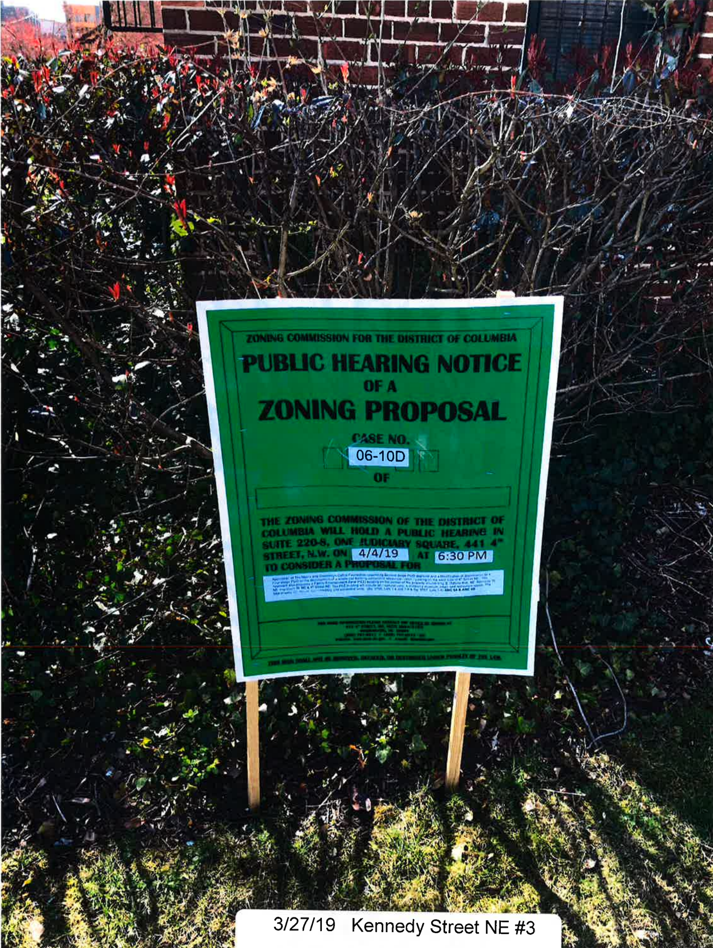
3/27/19 Kennedy Street NE #3