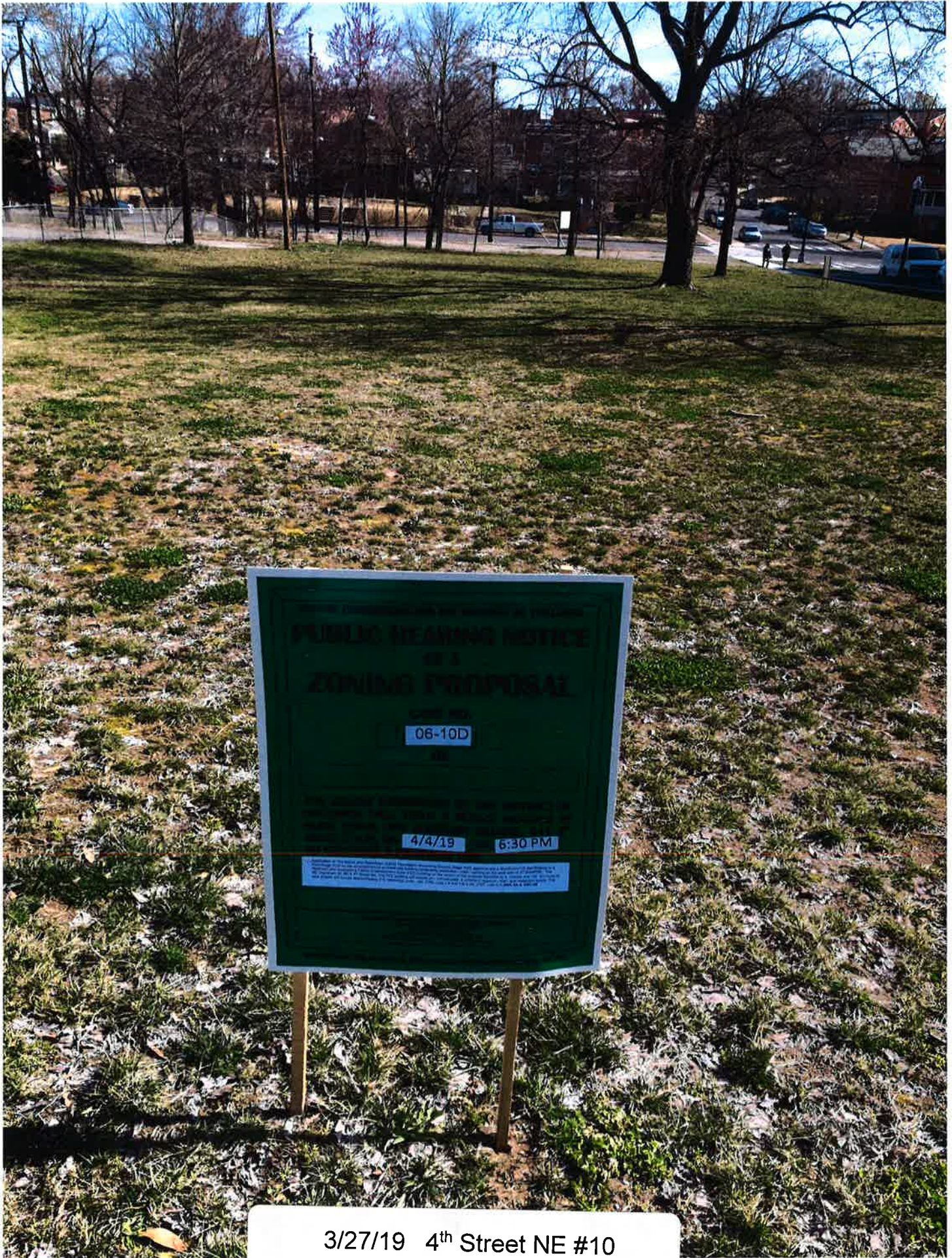
3/27/19 4 th Street NE #10